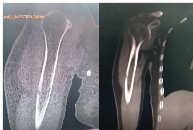
Fig. 2. CT scans of the right arm in bony and parenchymal views in the context of TAP CT (no soft tissue extension, no other suspicious lesions or lymphadenopathy)