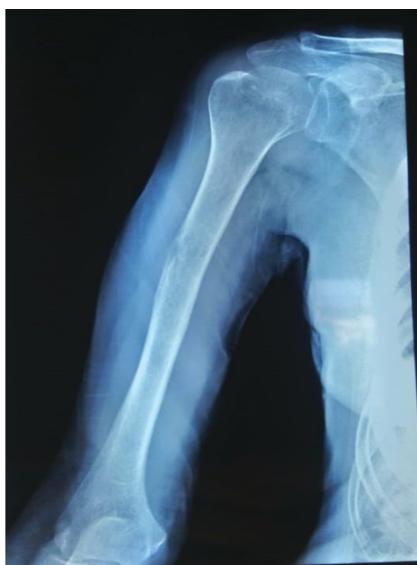
Fig. 1. Front radiograph of the right humerus (osteolytic lesion of the external cortex of the right humeral shaft, without periosteal reaction)

Primary bone lymphomas are defined by the primary location of a malignant lymphoma in the bone, with a negative extension assessment within 6 months of the positive diagnosis. Another inclusion criterion is unique bone localization, but some authors integrate multifocal bone lymphomas into primary bone lymphomas [2]. Primary bone lymphomas are rare. They predominate in men of median age between 40-60 years [4,5]. The classification used for primary bone lymphoma is that of Ann Arbor, which distinguishes four stages [6] (Table 1).