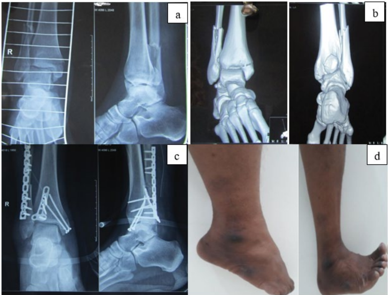
Fig. 4. a. Pre-op x-ray; b. CT-scan; c. post-op x-ray; d. functional outcome