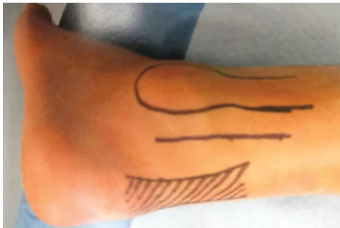
Fig. 1. Skin marking showing the incision for the posterolateral approach in between the tendon of tendoachilles and the posterior border of the fibula